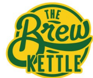
Brew Session & Beer Fridge