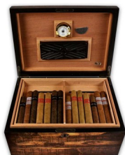
Humidor w/ Cigars