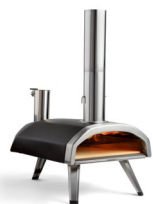
Oni Pizza Oven