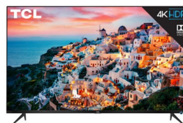
65" 4K TV